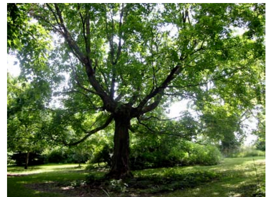
A Tree in Iowa

A paraphrase of an old Greek proverb seems particularly appropriate to apply to the history of 2010 at Northern Clay Center. The original proverb is: “A society grows great when old men plant trees whose shade they will never sit in.” My variation on that theme in 2010 (and into 2011) was “an arts organization grows great when old directors raise money they know they will never spend” with a codicil that says we do enough advance planning so that there is a legacy of direction (and some breathing space) but not so much as to strangle future creativity. Both the 20 th anniversary projects and the search for my successor incorporate the idea that while today is important, we must always and simultaneously look to tomorrow .