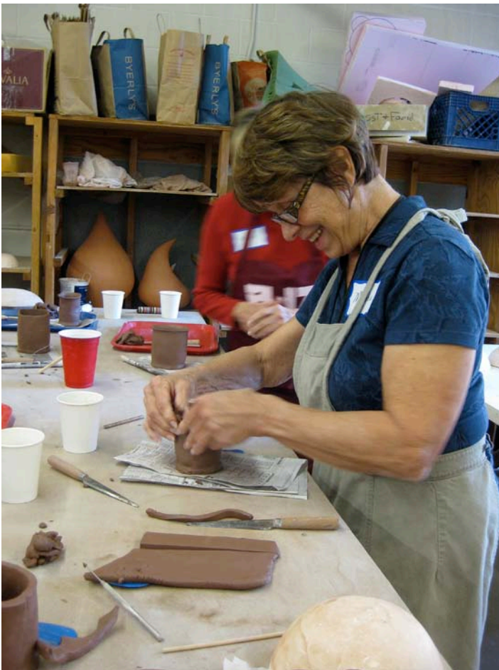
A participant in NCC’s partnership program with the University of Minnesota’s OSHER program.

From social gatherings, tours, and visiting artist lectures to multi-week handbuilding and wheel-throwing classes that served persons 55+ and their grandkids and families, an additional 687 individuals were introduced to clay and the Center’s offerings. They responded with delight and interest and in some cases, a determination to keep coming back.”