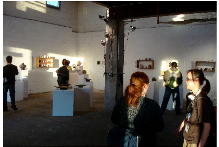
Touring exhibition, Exquisite Pots , on display in Collinswood, NJ during the 2010 NCECA Conference.