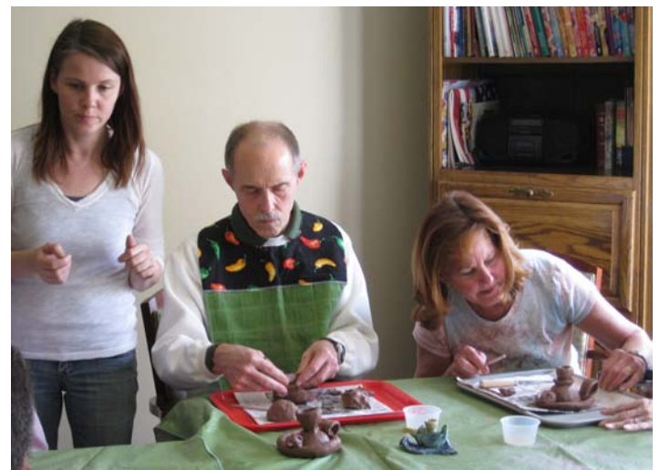
Residents at Ebenezer Ridges in Burnsville participate in a weekly clay class, which is part of NCC’s Wallace Excellence Award initiative.

Ongoing adult and children’s classes showed mixed results in 2010: enrollment in adult classes was down, but enrollment for children increased by 11%. Outreach programs (apart from the Wallace project above) increased dramatically over 2009: 188 unique partnerships, a 38% increase over 2009, with 6,544 participants, a 23% increase over 2009. These numbers do not include the 2,000+ who went through NCC’s tents at the Uptown Art Fair. Eleven schools with which NCC has had ongoing partnerships secured their own monies to cover the entire costs of NCC-facilitated after-school and school day programs, attesting to their commitment to clay art education for their students.